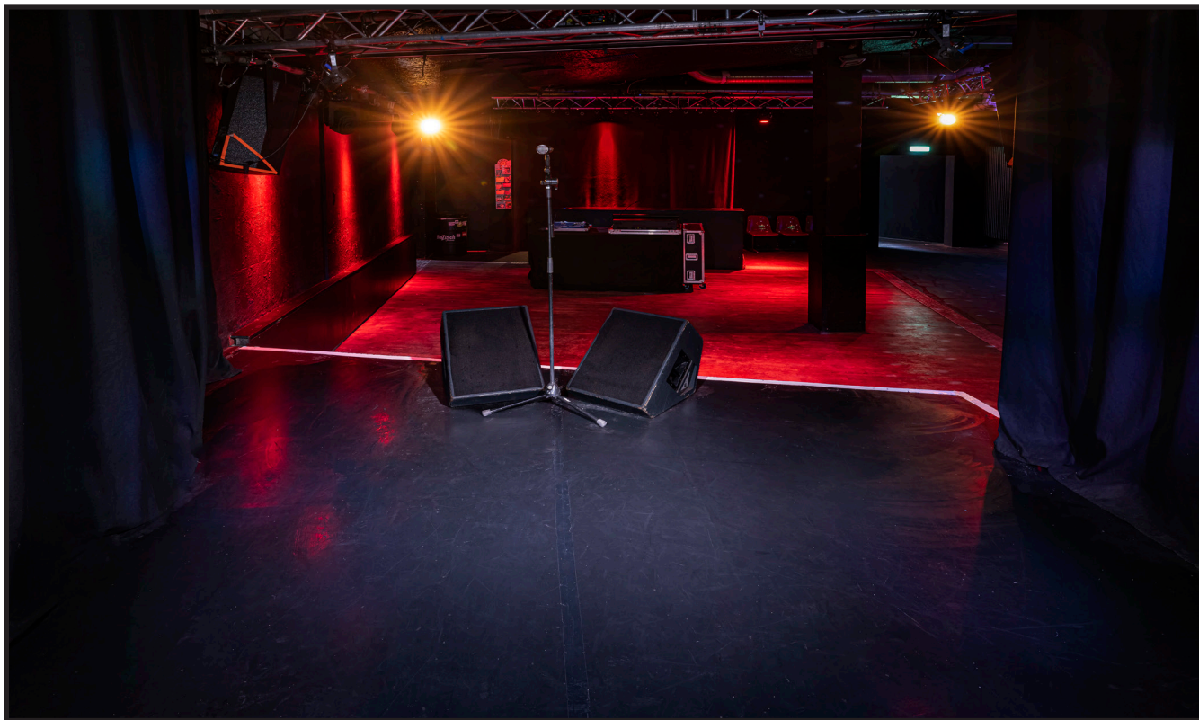
Mephisto 1: View from stage