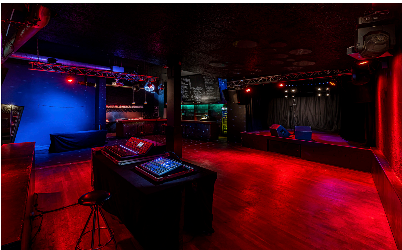
Mephisto 2 View from FOH